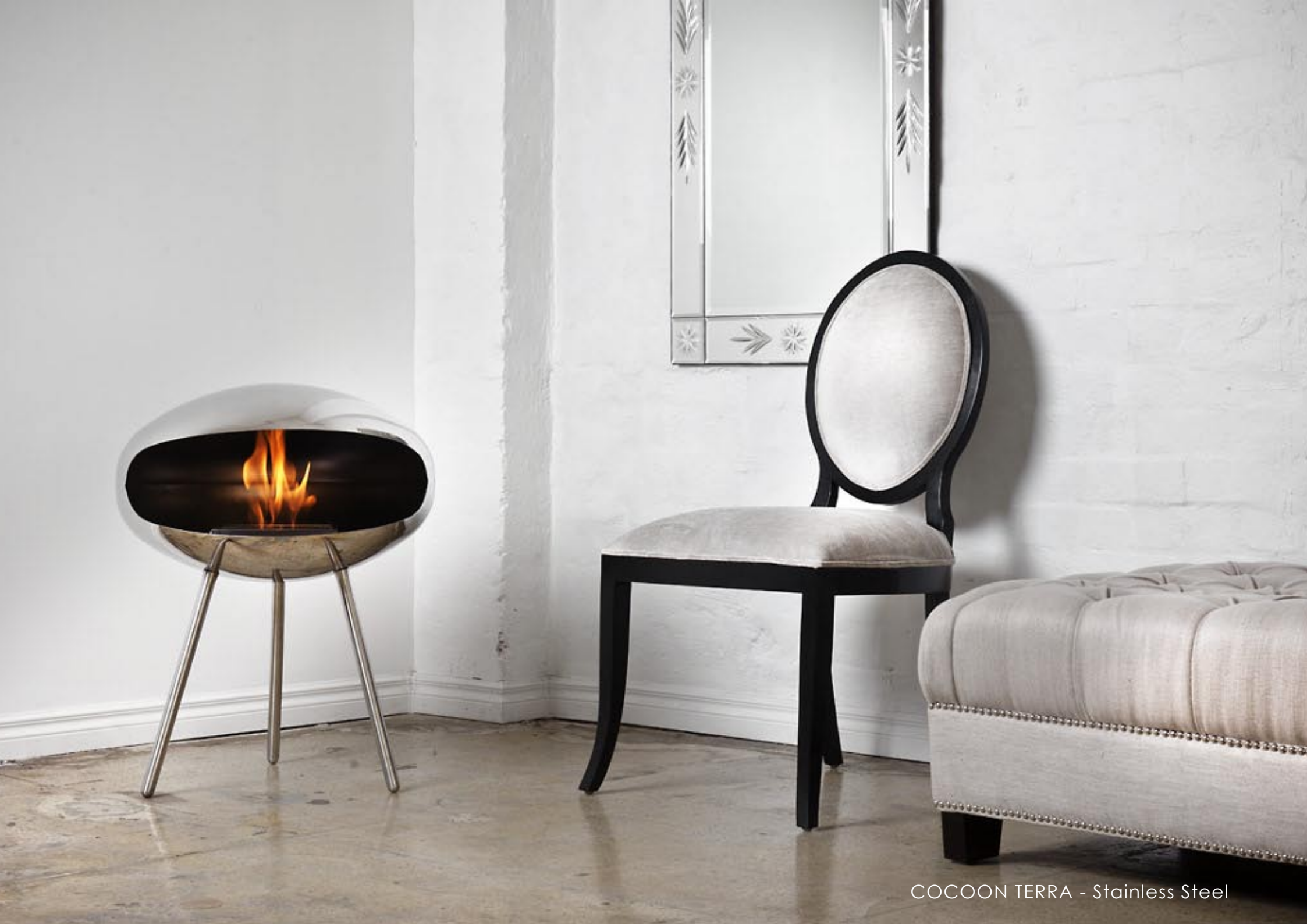
COCOON TERRA - Stainless Steel