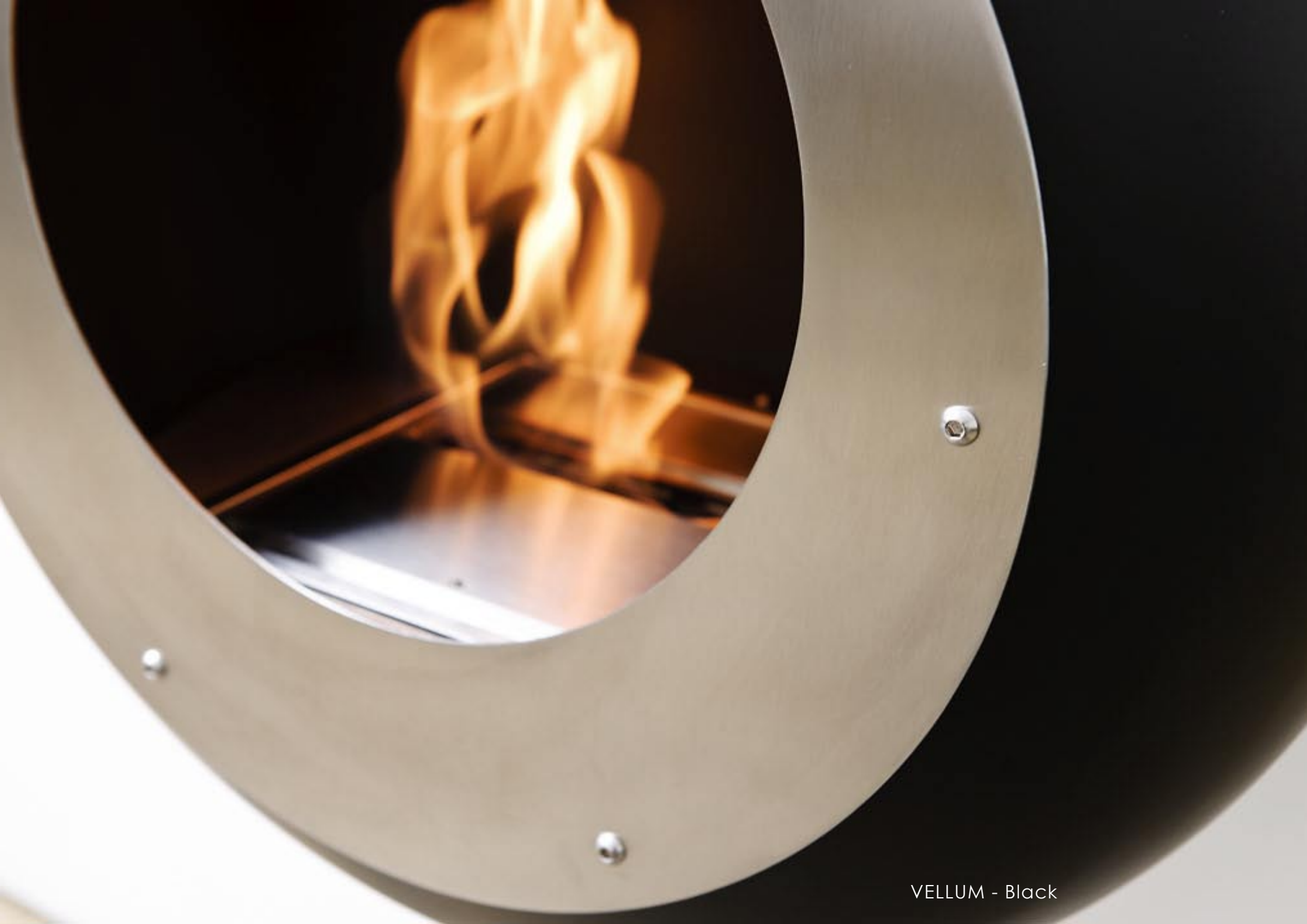
VELLUM - Black