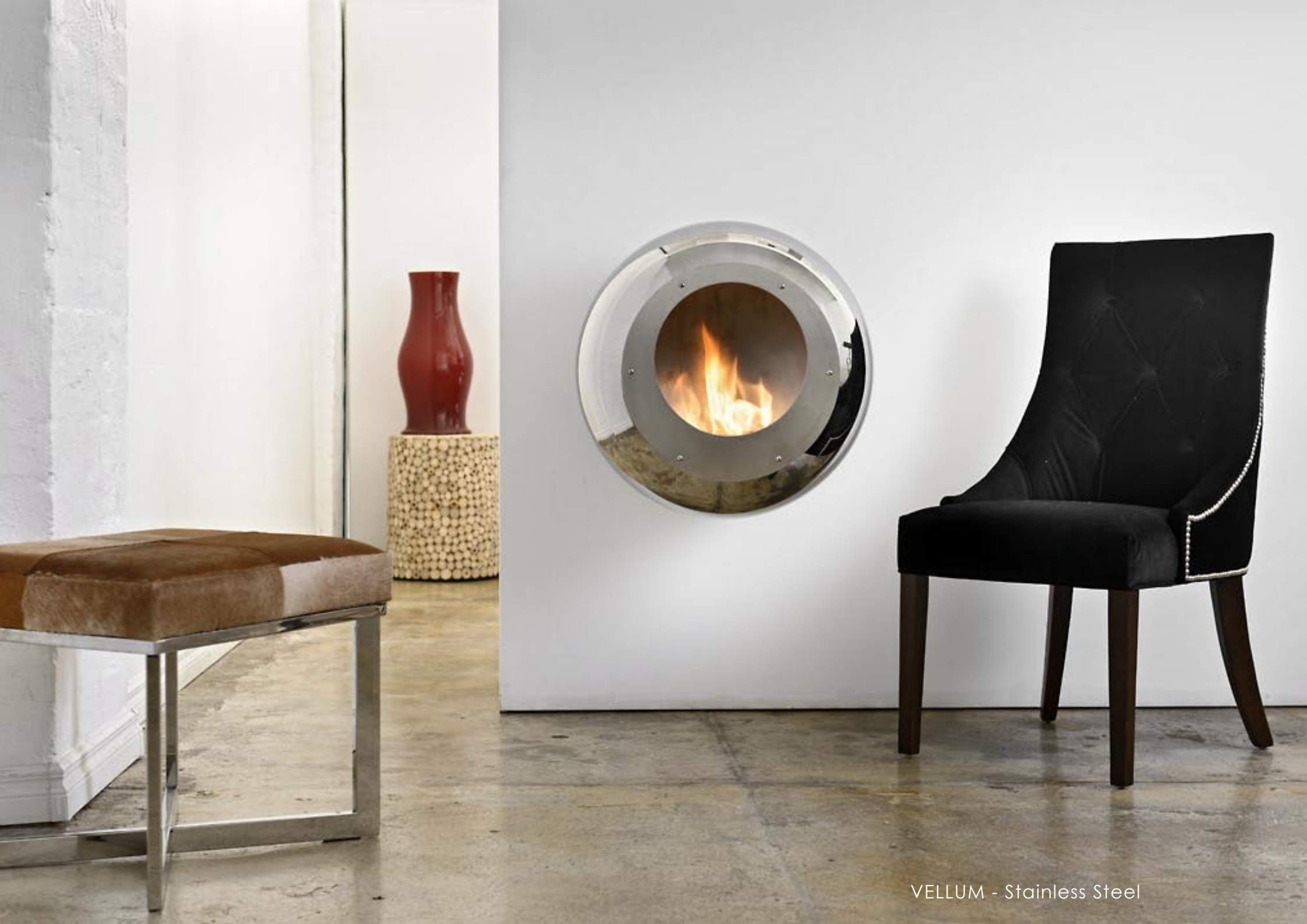
VELLUM - Stainless Steel