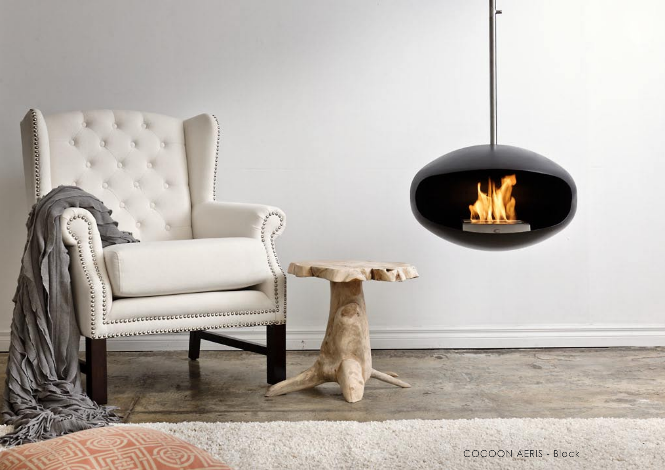
COCOON AERIS - Black