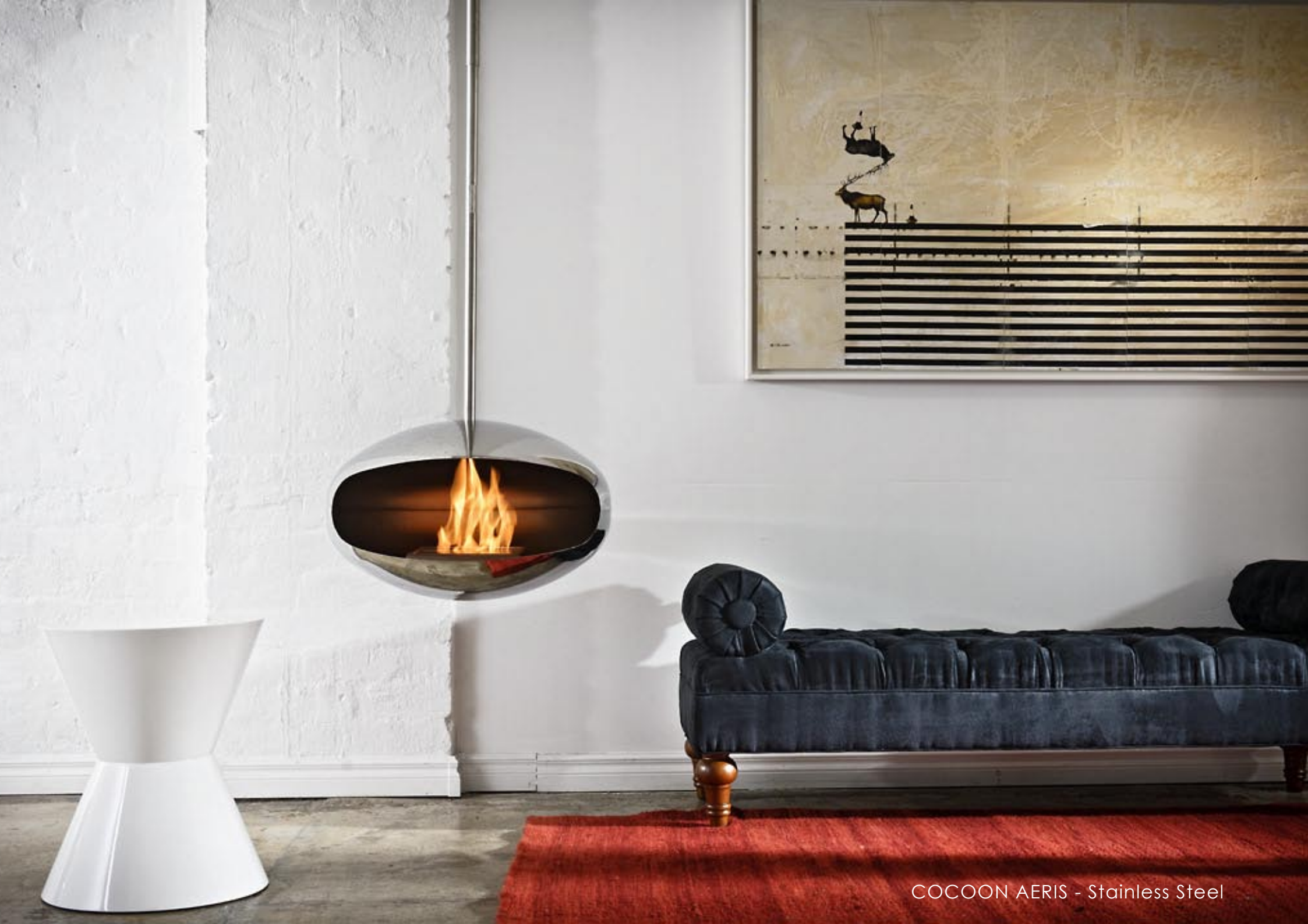
COCOON AERIS - Stainless Steel