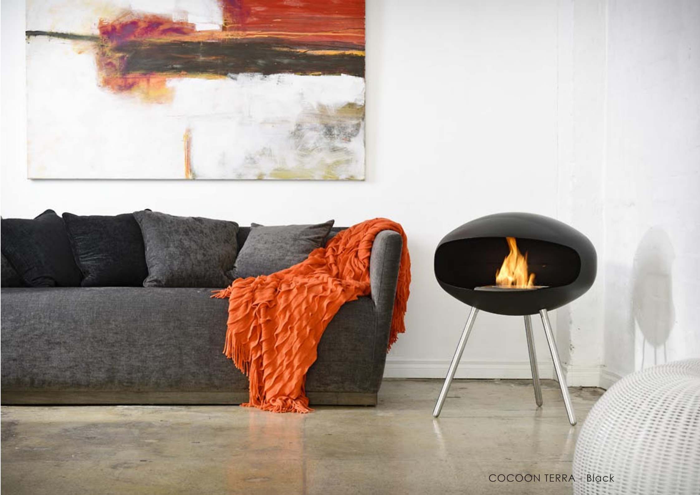
COCOON TERRA - Black