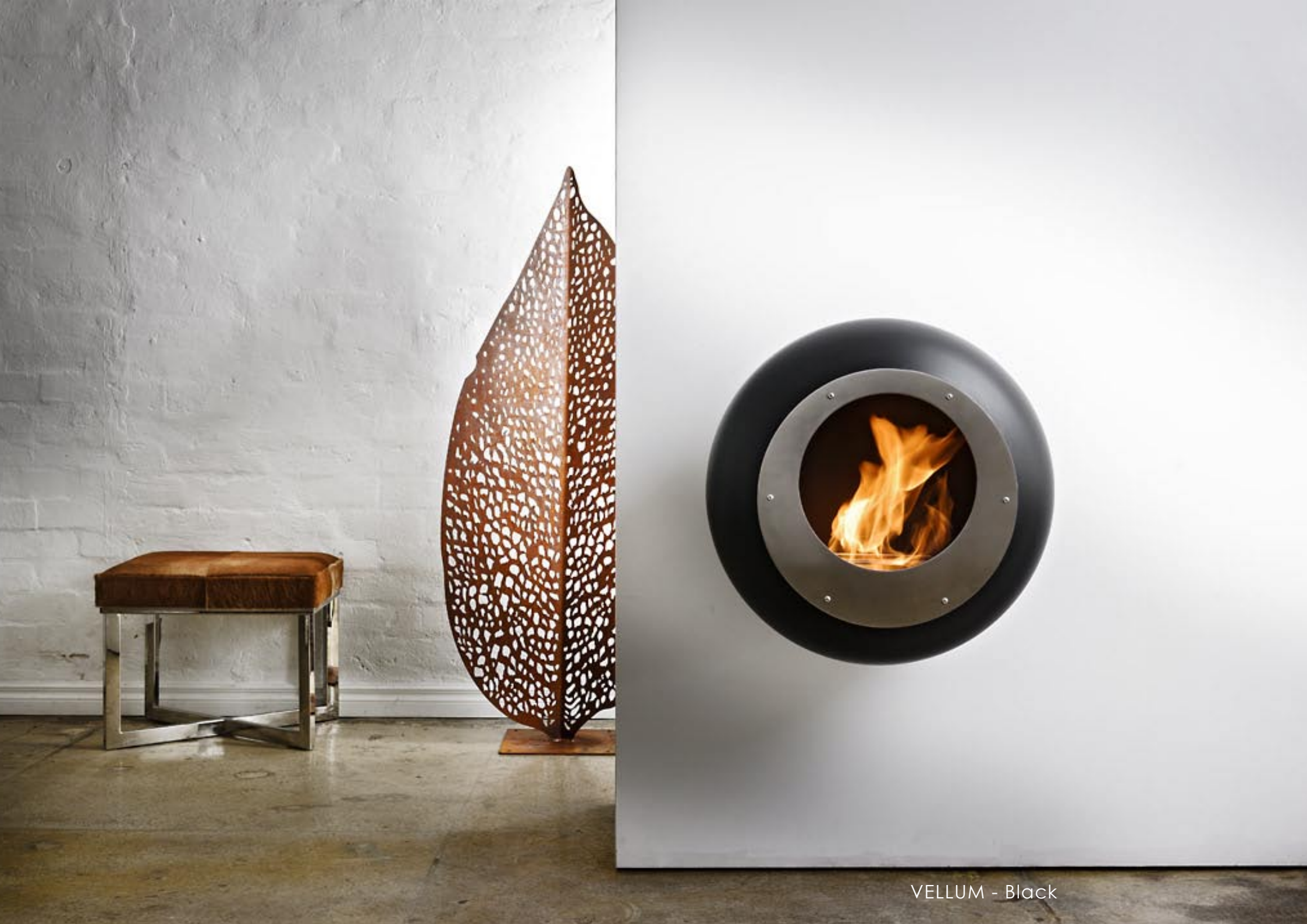
VELLUM - Black